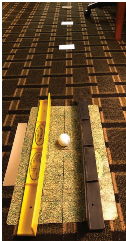
Motel Carpet And Distance Control Drill